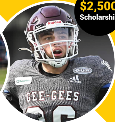
Today, he plays as a receiver for the University of Ottawa Gee-Gees.