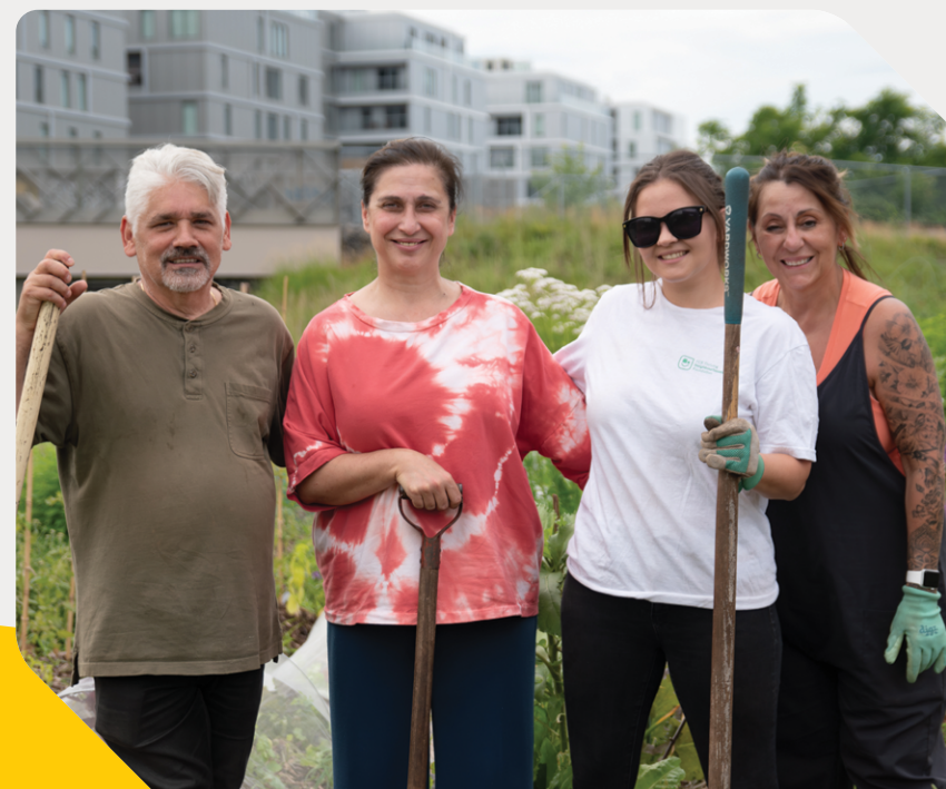
Photo of the first visit by a group of First Capital employees to our garden, where they weeded and harvested vegetables for our food bank.